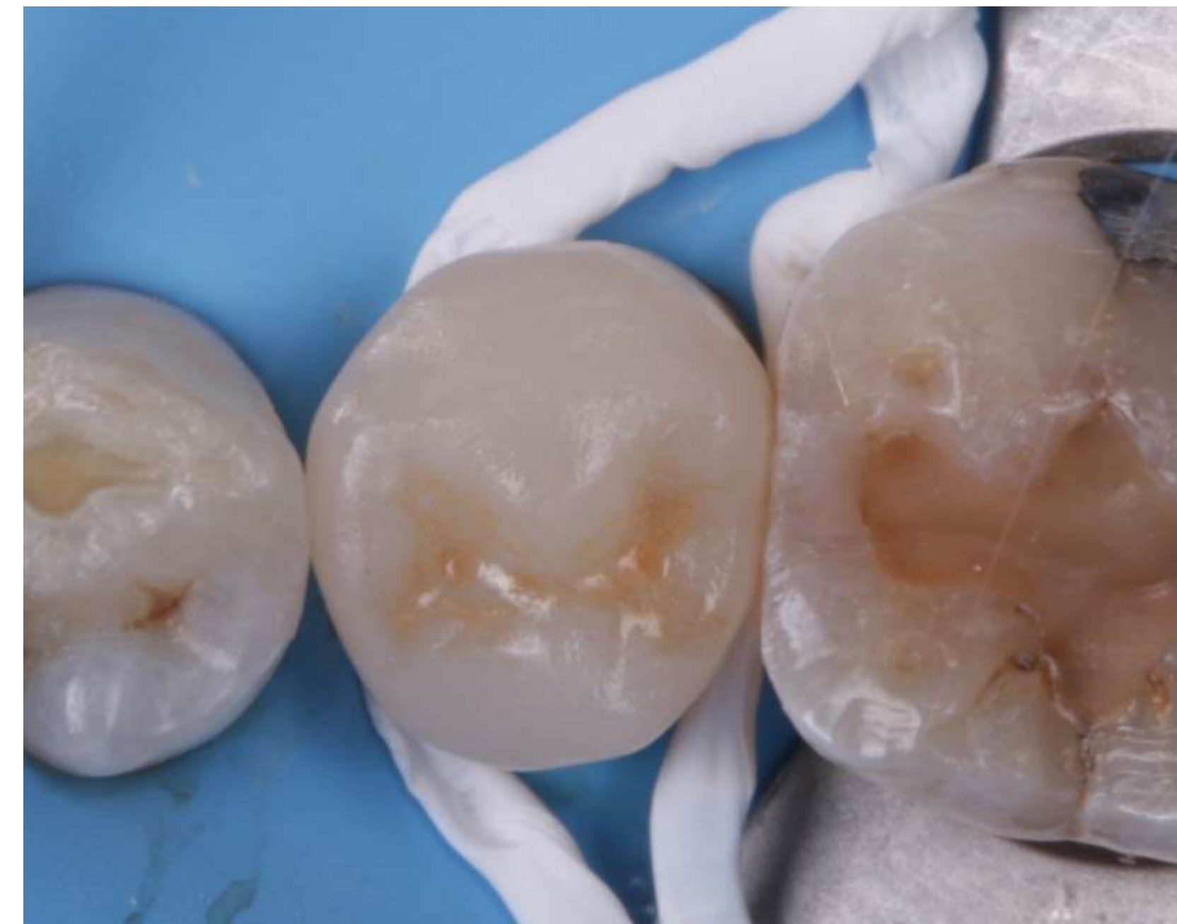
Proof of ceramic onlay prepared in the same day