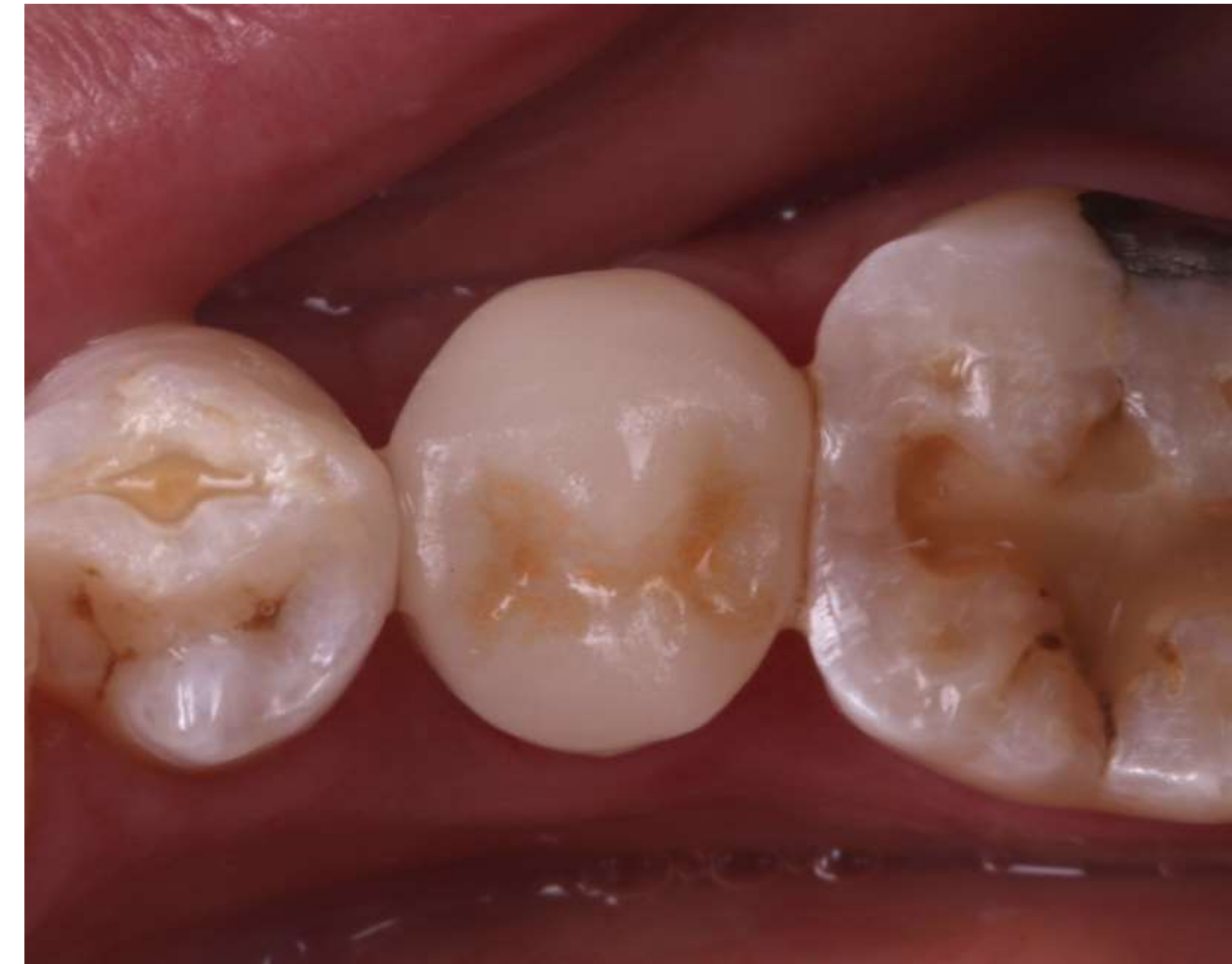
Cementing and final result