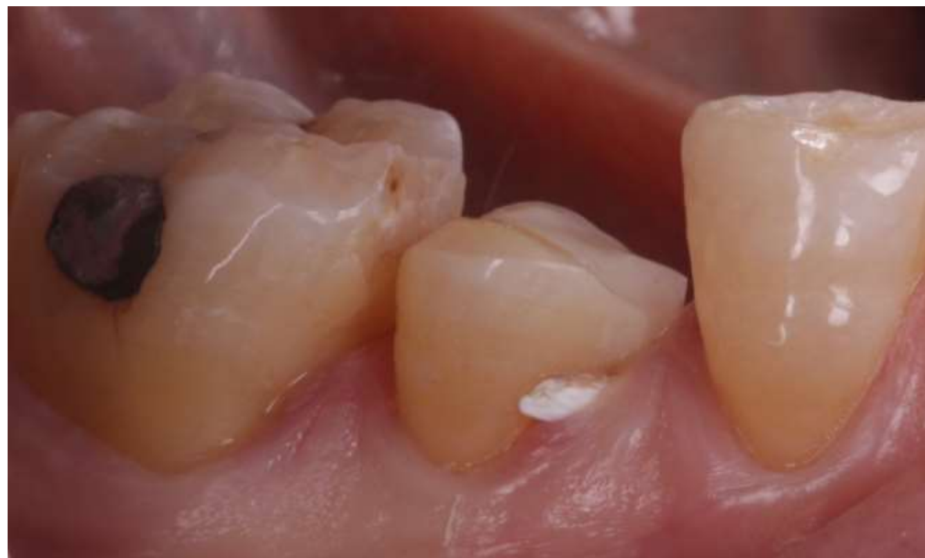
Preparation complete and ready for intraoral scanner