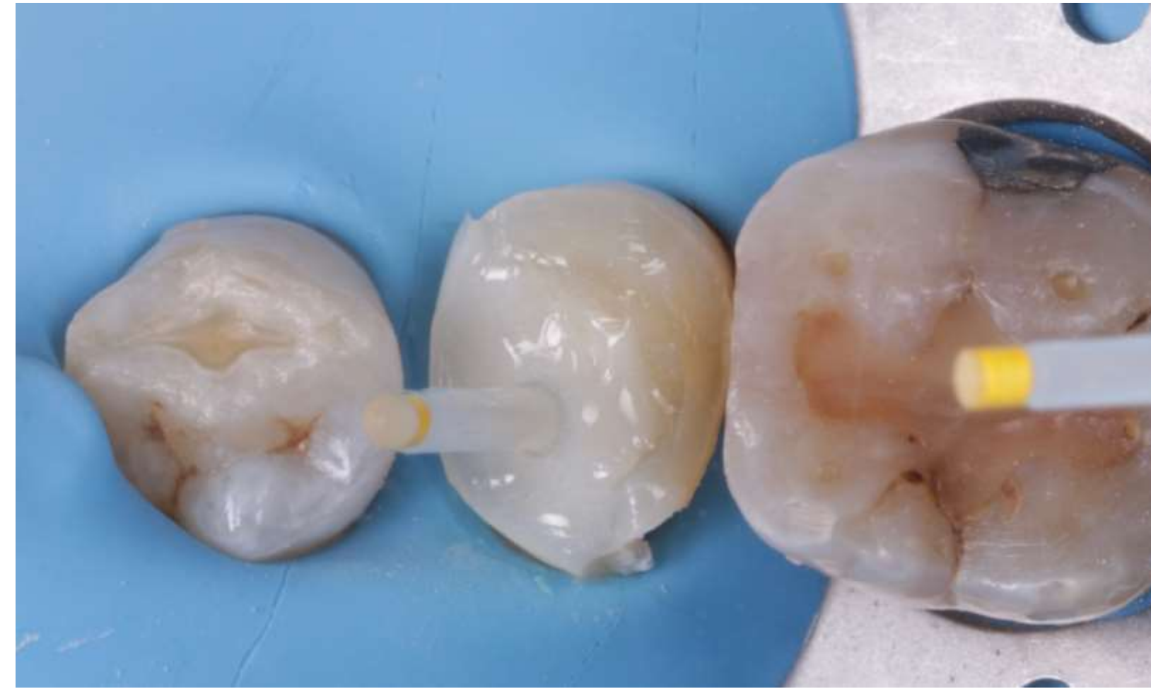
Cervical margin elevation and fiberglass post cementation