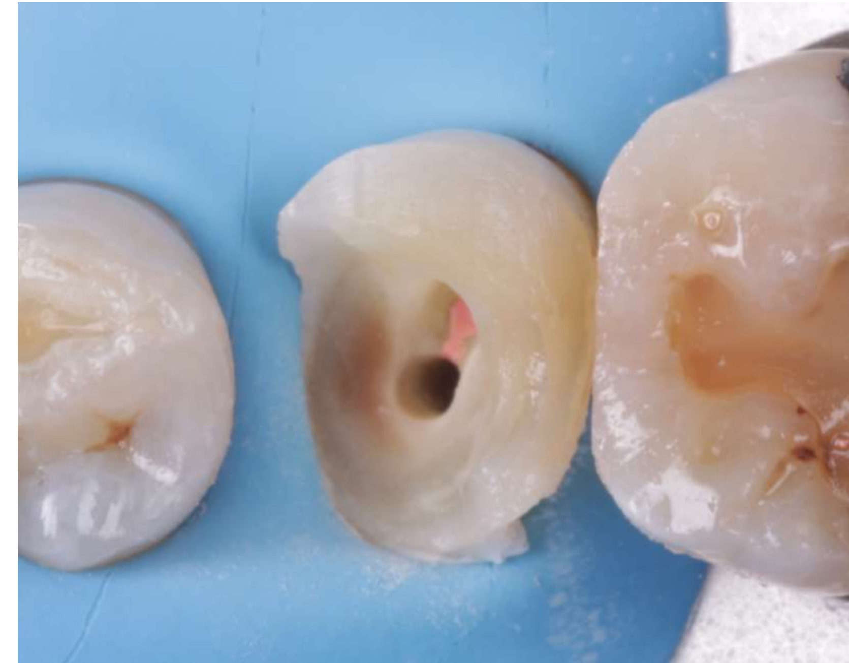
Absolute isolation, cleaning and preparation for fiberglass post